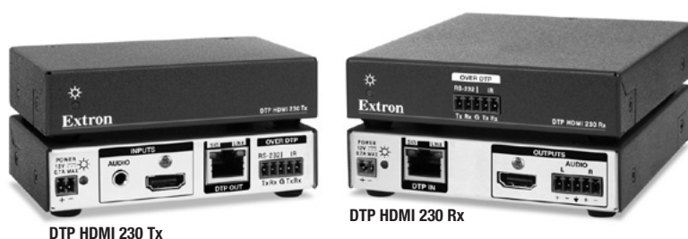
DTP HDMI 230 Tx